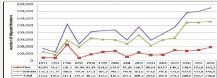
Figure 2. Migrant Workers Placement by Sex and Year, 1994-2008 (official data, does not include undocumented migrants)

Source: http://bnp2tki.go.id/ , accessed 4 January 2011